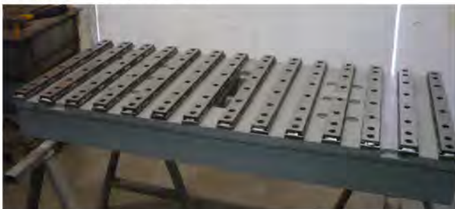
Wear Sliding Strips used on a brick mould machine

WSS are also suitable for machines that have to sustain high forces and vibrations while working in abrasive environments.