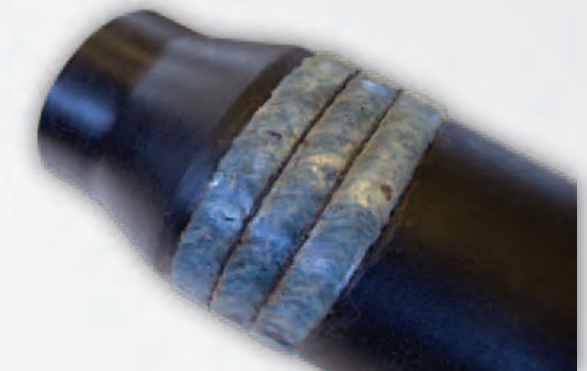
OTW 12Ti hardbanding alloy applied on a tool-joint