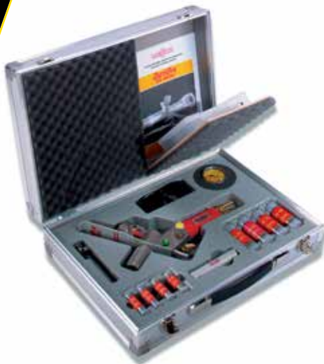
Aluminium suitcase CDS 8000, robust and practical

On-line inspection is conducted at all stages from reception to final packaging. Castolin Eutectic's factories can make experimental batches, integrating on-going R&D into the production process. Both our gas-atomised and water-atomised powder plants have EN ISO 9001 or 9002 approvals.