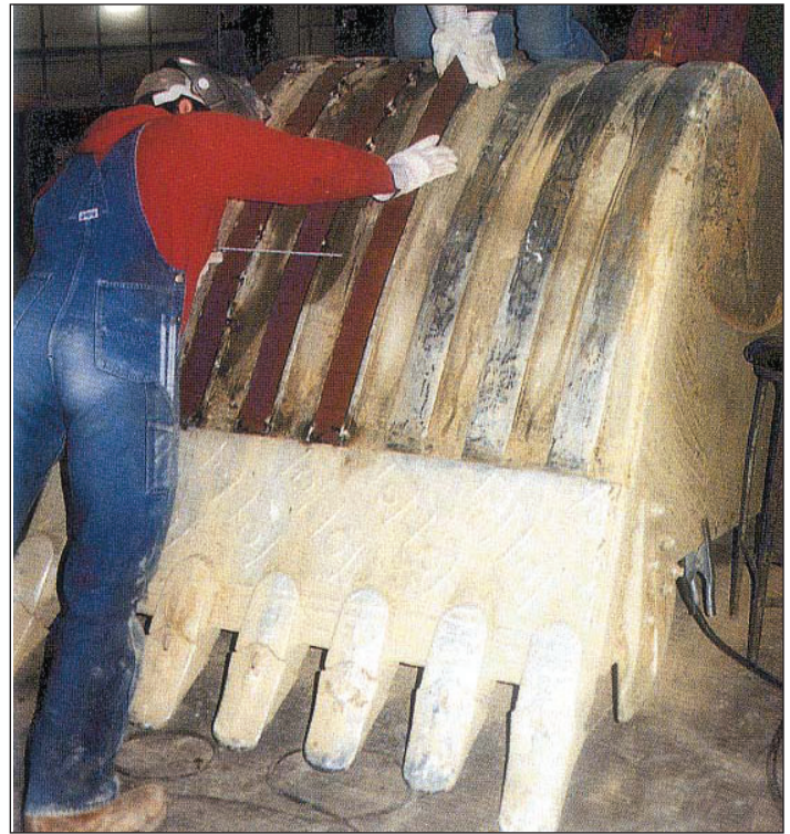
Typical excavator bucket application