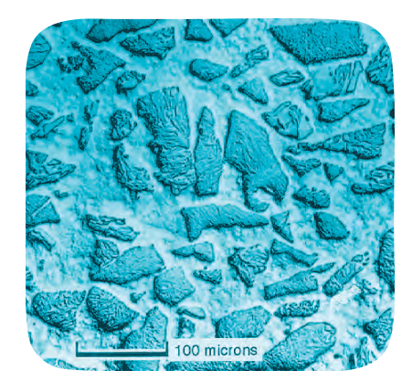
Densely packed hard phases bound in the matrix form an inpenetrable barrier to abrasive particles (microphoto).