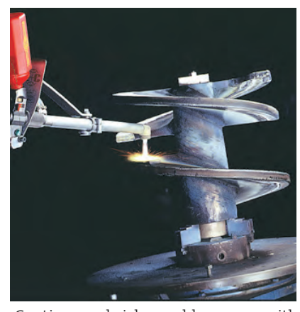
Coating a brick-mould screw with Eutalloy SF 15211 anti-abrasion alloy.

The above product technical properties are based on Castolin Eutectic quality assurance standards and procedures for use. Procedures and applications other than those specified may alter these properties.