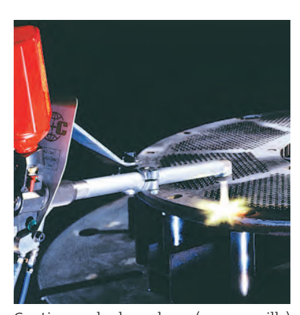
Coating a hydropulper (paper mills) with Eutalloy SF 15211.