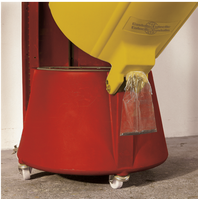
Figure 1: Details of the dust-free emptying of the filter residues