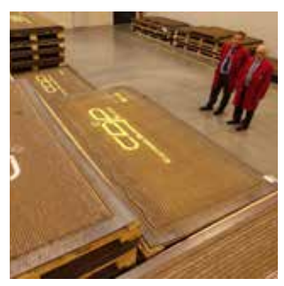
CDP® are engineered for exceptional wear resistance.