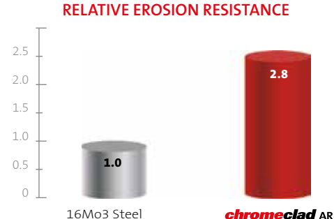
Using quartz particles at 30° impact angle at 550°C