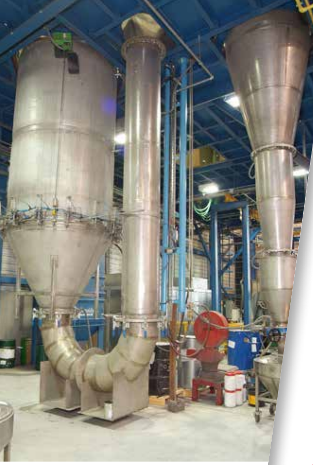
Castolin Eutectic Laser Powder Production