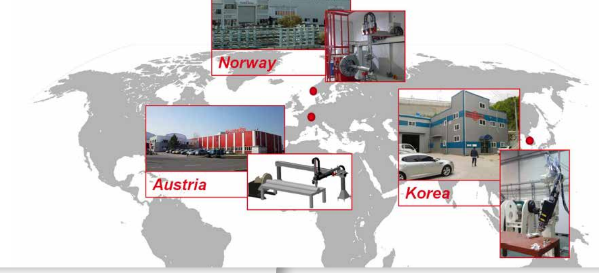
Castolin Eutectic Laser Facilities