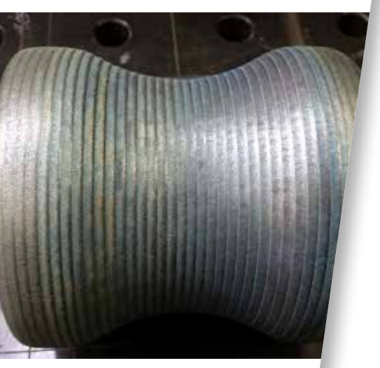
Smooth surface after Cladding